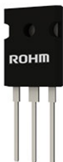
TO-247N (16.0mm x 41.0mm x 5.0 mm)