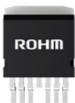
TO-263-7L (10.2mm x 15.4mm x 4.5 mm)