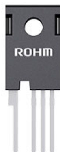
TO-247N-4L (16.0mm x 41.0mm x 5.0 mm)