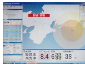
Emergency earthquake bulletin

In order to ensure the safety of its employees and guests, ROHM has introduced general emergency broadcasts using emergency earthquake bulletins and implemented training broadcasts in order to ensure internal stability. The company has also set up disaster prevention storerooms and stocked them with food and essential supplies, including rescue equipment, in the interests of restoring business operations.