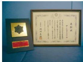
Receiving "Outstanding Independent Fire Prevention Workplace" award from the mayor of Kyoto City (3.8.2009)

In recognition of its extensive efforts to conduct regular independent fire prevention and disaster prevention activities, ROHM Headquarters received an award for "Outstanding Independent Fire Prevention Workplace" from the mayor of Kyoto City at the 2009 "Firefighting Day" awards ceremony.