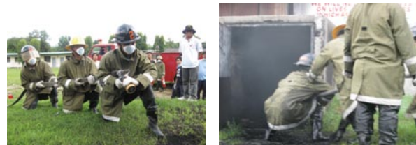
Self-defense firefighting team training / REPI (9.15.2008)

ROHM has organized self-defense firefighting teams for emergencies and provided them with small powered pumps, chemical protection suits, disaster prevention and fire prevention clothes, rescue equipment, and other equipment for dealing with natural disasters, as appropriate for the conditions at each company. The company has implemented hands-on firefighting training in anticipation of fires or earthquakes, general evacuation training, and handling hazardous materials in clean rooms in order to ensure that ROHM workers can act promptly and appropriately should a disaster occur. ROHM also strives to cooperate with local disaster prevention by participating in training events and general disaster prevention trainings in local communities.