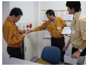
Company-wide fire prevention patrol by the committee for fire prevention measures (11.13.2008)

ROHM has strengthened its fire prevention management through patrols and meetings led by the committee for fire prevention measures and special teams. Through independent inspection by fire source supervisors at each work site, ROHM was able to reduce its risk of fires and disasters.