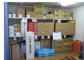
Goods stored in disaster prevention storeroom