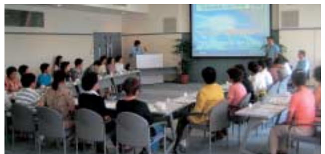
Environmental exchange meeting with a local women's group

ROHM Fukuoka holds exchange meetings with local residents regarding its corporate and environmental activities and strives to improve understanding of the local environment.