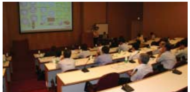
Information exchange with environmental supervisors from various industries

The ROHM head office invites environmental supervisors from various types of industries for a conference on promoting waste reduction in Kyoto where opinions are discussed regarding waste reduction measures (primarily through plant observation) and waste reduction policies in the city are promoted.