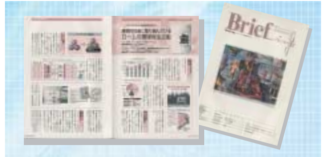
Public relations magazine, "Briefing"

The public relations magazine, "Briefing," provides information about ROHM's environmental activities to a wide range of people including shareholders, government and other public offices, and the mass media.