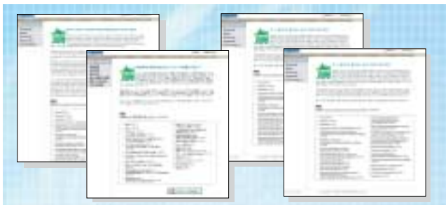
Website (Japanese, English, Chinese, Korean)

To disseminate information about ROHM Group's environmental-conservation activities across the globe, ROHM's environmental report is made available on the company's website.