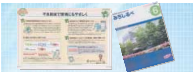
In-house journal "Michishirube"

At the ROHM Head Office, the in-house journal Michishirube (meaning "guidepost") has published monthly issues since the company was established. The magazine contains articles about current environmental issues and activities. Each Group company also publishes its own in-house journal to facilitate environmental communication within the company.