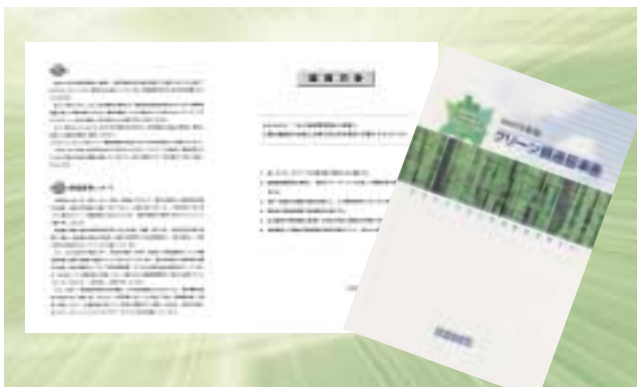
Green Procurement Criteria

In order to manufacture products with low environmental impact, ROHM revised its "green" procurement standards in 2006. Pursuant to this revision, ROHM requests all ROHM Group vendors to further strengthen their environmental management systems and guarantee that no materials and parts delivered by them use or include substances prohibited by ROHM. Also, ROHM has accurate information regarding substances with environmental impact with respect to all elements included in materials and parts for ROHM's products, and ROHM has constructed a framework to ensure that prohibited substances are not included in ROHM's products.