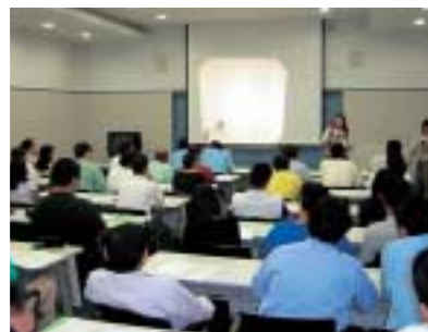
Green procurement orientation session in REPI (Philippines) for vendors